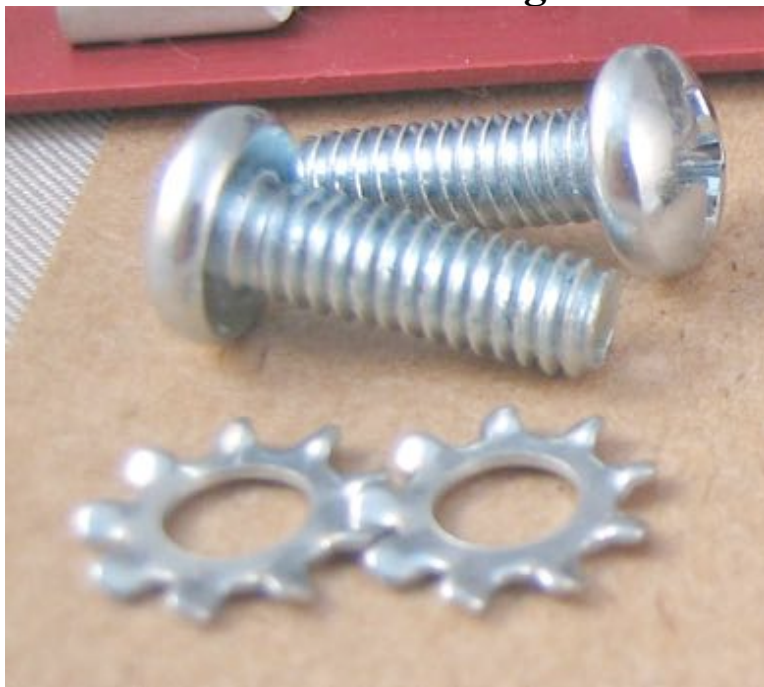
(2 pc) 8-32 X 1/2 Machine Screws / Phillips / Pan Head / Steel / Zinc (2 pc) #8 External Tooth Lockwashers / Steel / Zinc