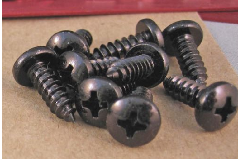
(9 pc) 8 X 1/2 Self-Tapping Screws Phillips / Pan Head / Type AB / Steel / Black Zinc (1 pc. is extra)